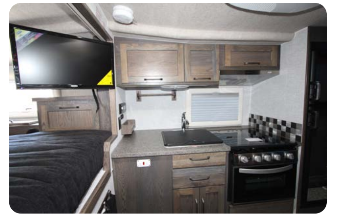
Grevstokes Wood Interior