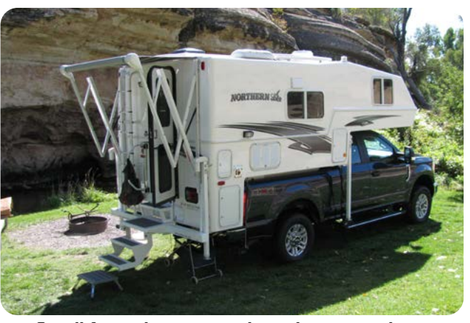
Small footprint to camp just about anywhere