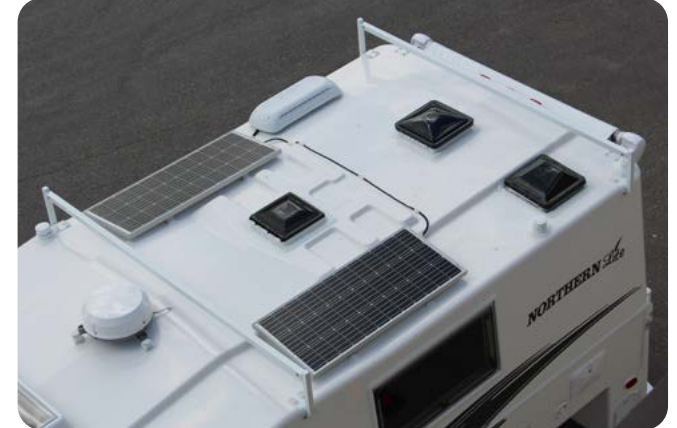
Boat Rack and Dual Solar Panels