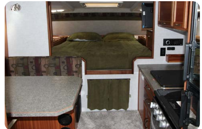
Multiple Interior Color Options