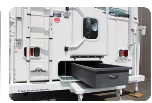
Sliding Tray in all Models

"Northern Lite truck campers are built to withstand whatever Mother Nature may throw at you. Our two-piece fiberglass construction will keep you warm in the coldest Canadian winter, cool during an Arizona summer and dry during a torrential downpour on the Oregon Coast."