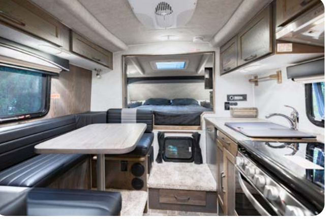
Premium Leatherette Seating