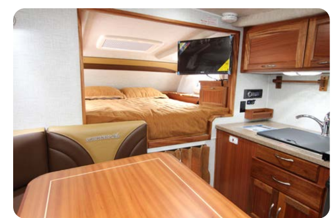
Solid Sapele Hardwood Dinette Table