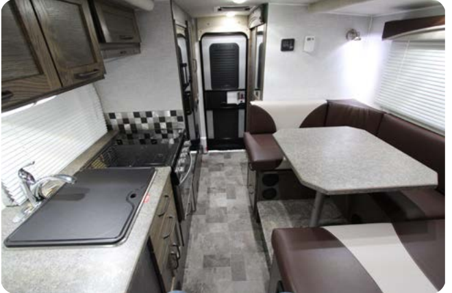
Brown and Light Grey Leatherette Seating