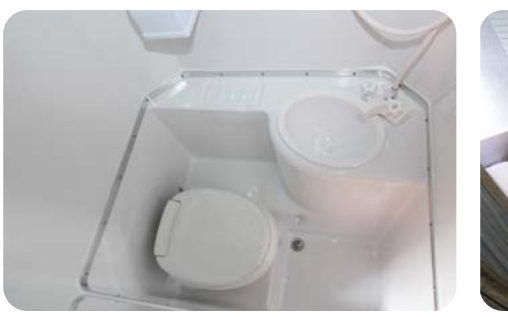
Bathroom with Sink, Toilet, and Shower