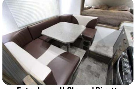
Extra Large U-Shaped Dinette