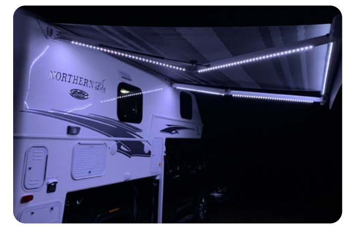
New Power Side Awning!