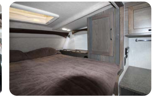
Optional Additional Bedroom Storage