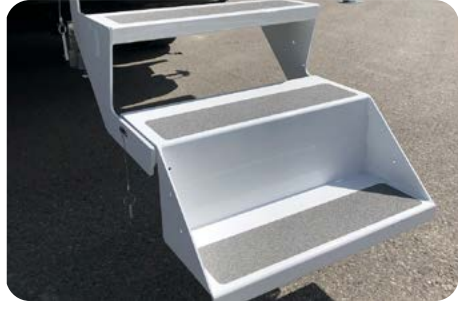
New Removable 3rd Step!