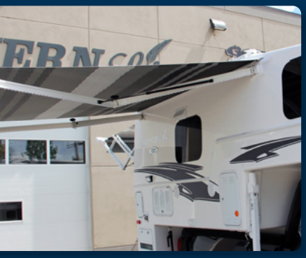
10' 5" Power Side Awning on LE Models