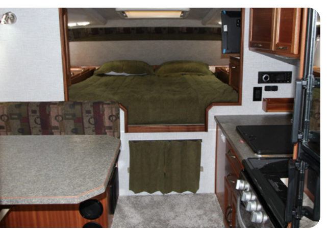
Multiple Interior Color Options