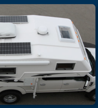
Dual 185 Watt Solar Panels on LE models