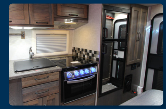
Modern Decor and Appliances