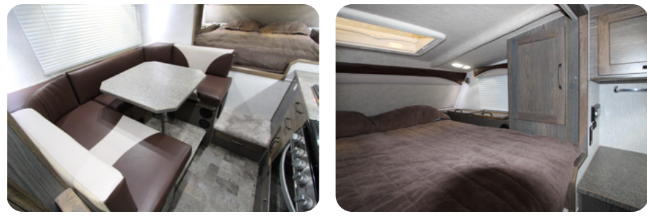
Extra Large U-Shaped Dinette