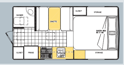
8'11" Q Sportsman Series

With face to face dinette · Fits full size short box trucks