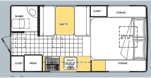
9'6" Q Sportsman Series

With face to face dinette · Fits full size short box trucks