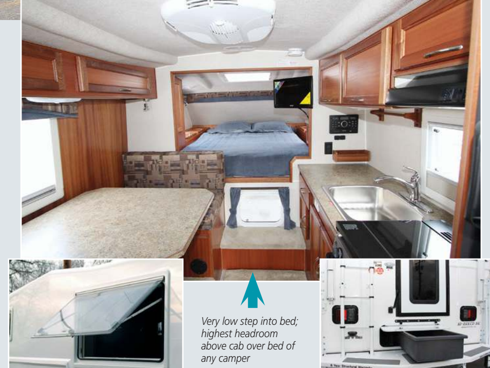
Dometic Acrylic Thermal Pane Windows are 50% lighter than conventional Thermal Pane Windows and have a higher R value.