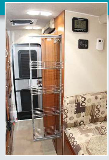
Pull Out Pantry

Interior of 10'2 SE showing Dometic Skylight and LCD TV in bunk area and Dometic Acrylic Thermal pane Window in kitchen area.